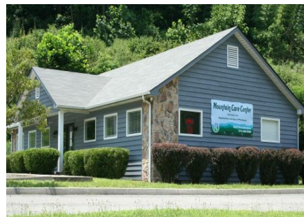
Mountain Care Center